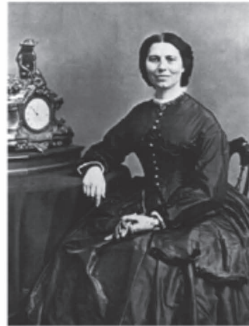
Historical Photo Services